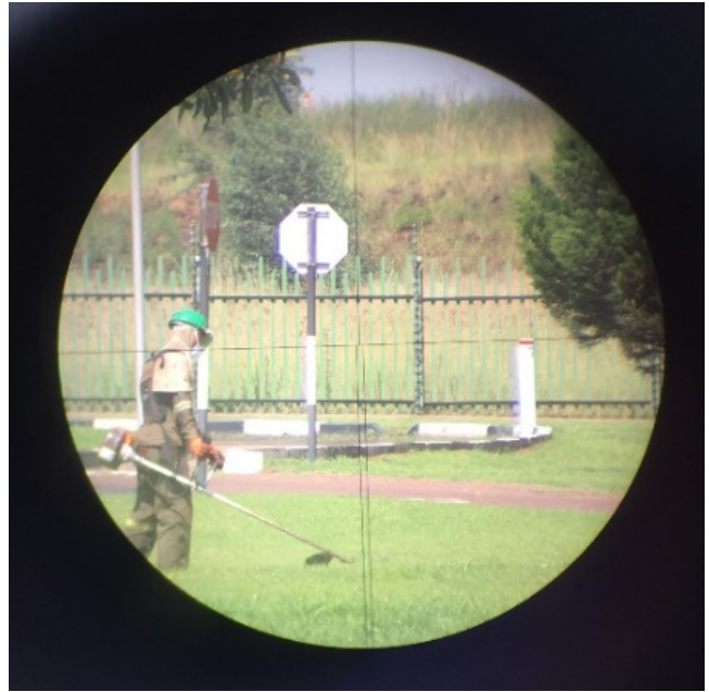
Figure 14. The alignment error factor

The following photograph illustrates the alignment error over a short distance. The cross hairs of the total station are focused over the control beacon. It clearly illustrates the error in alignment between the optical centre of the total station and that of the gyro attachment.